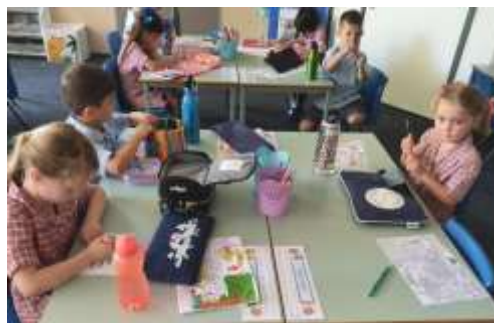
Our new preps at work