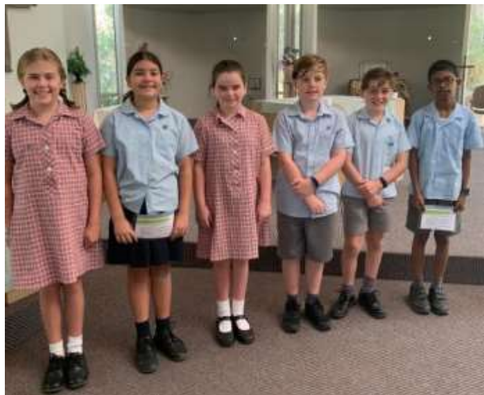
Mini Vinnies Group