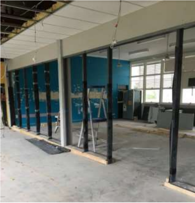
Block C Classroom