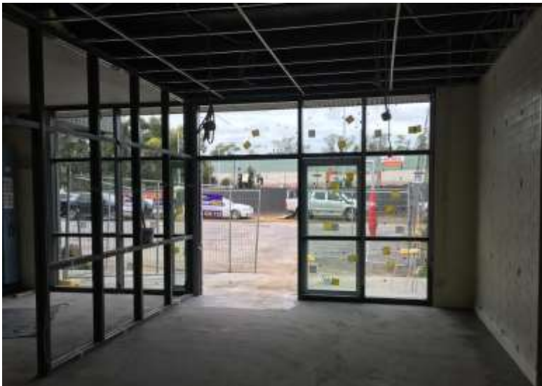
Block B Entry