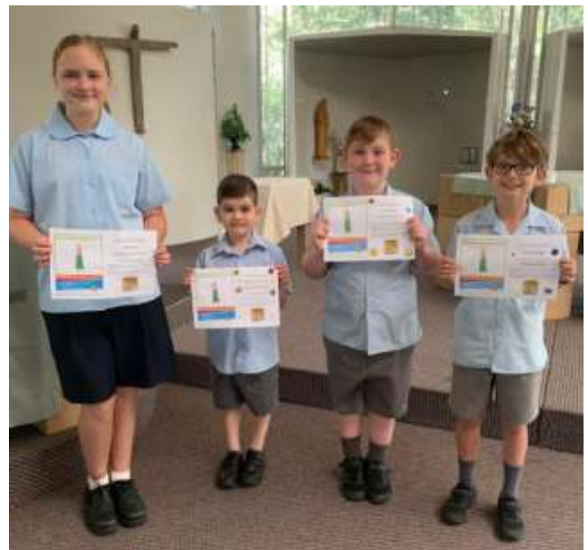
Week 3 Students of the Week