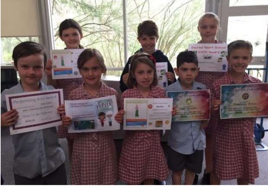
Week 4 Students of the Week