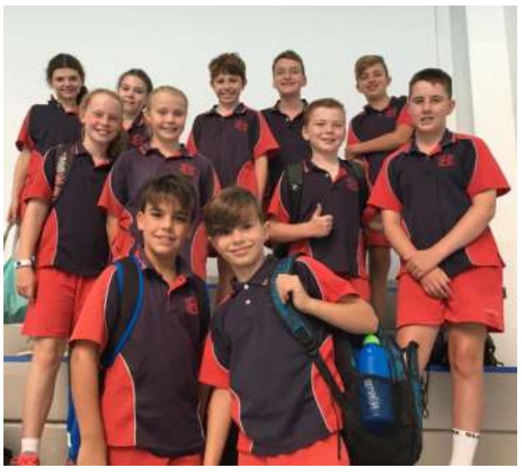
2020 Sacred Heart District Swimming Team