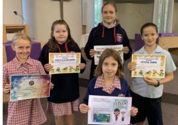
Week 5 Students of the Week