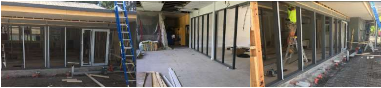
Block C – Library Space & Classrooms