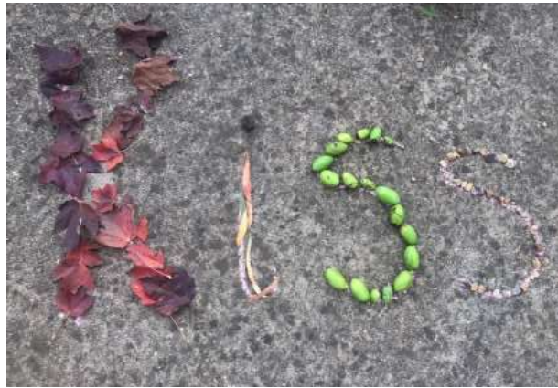
SMART spelling - Jack N