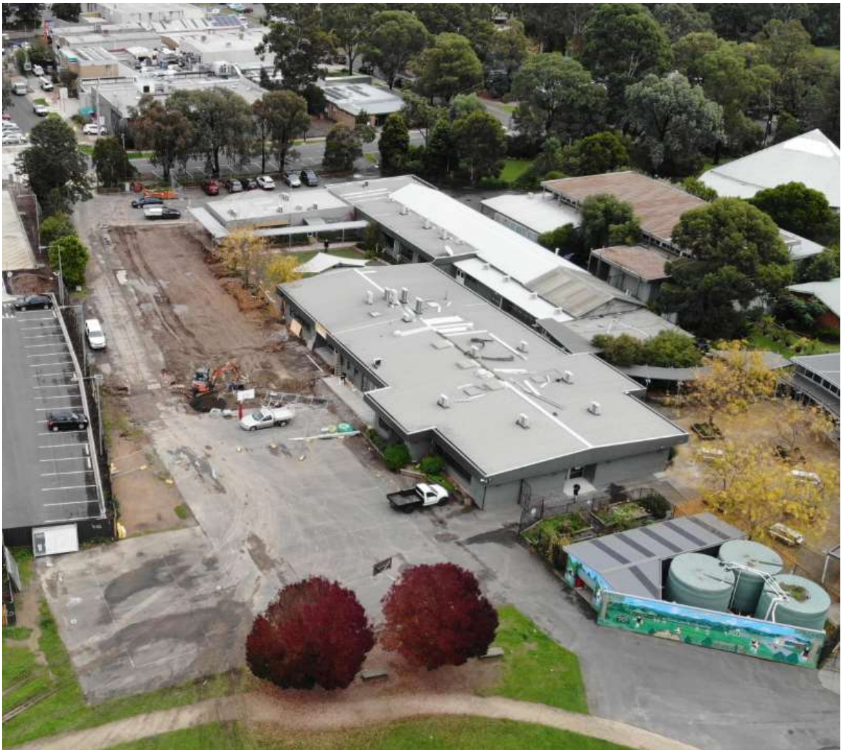
Removal of Block A - New Welcome Garden Space