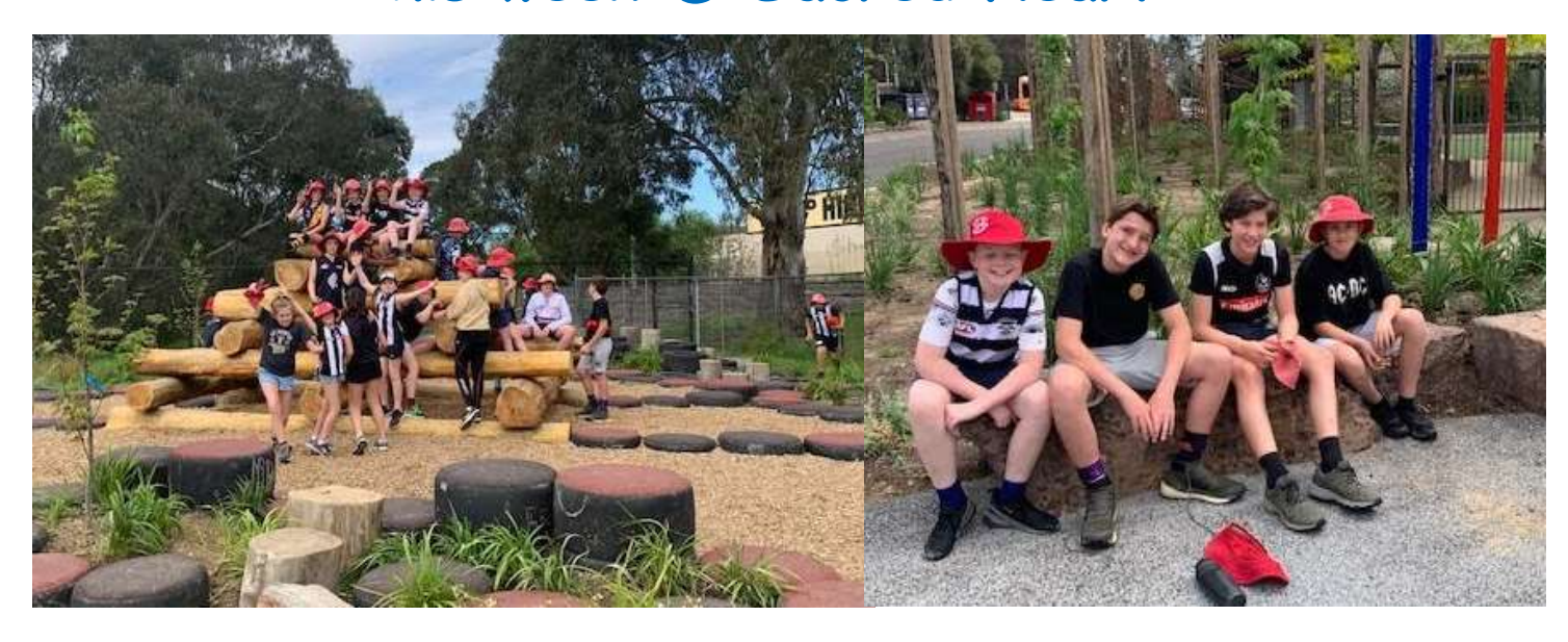
Footy Colours Day