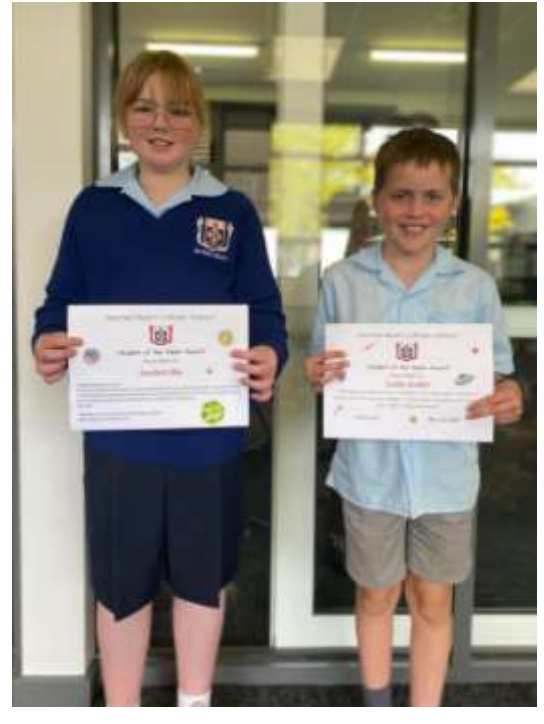
Week 2 Students of the Week