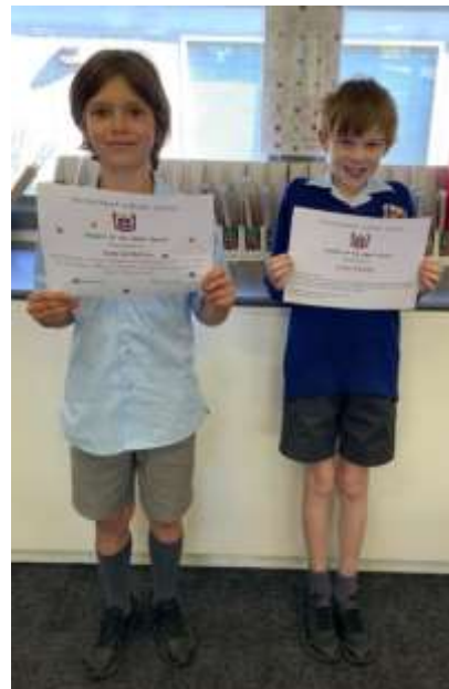
Week 3 Students of the Week