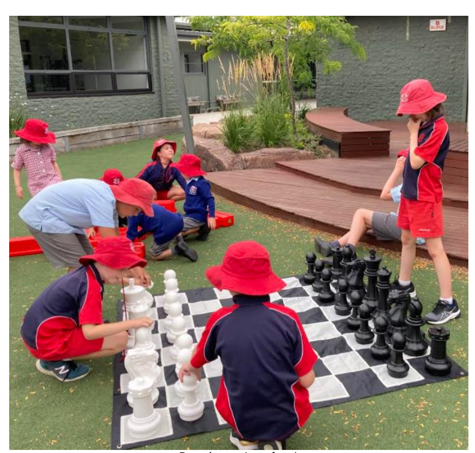
Passive play fun!