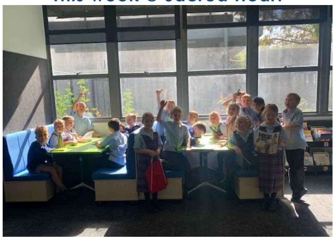
1/2 CN loves library time!