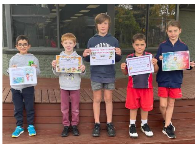
Week 1 Students of the Week