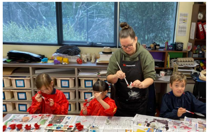
Year 1/2 students making ANZAC wreaths in Visual Arts