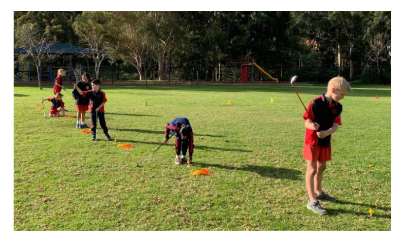
Golf in PE