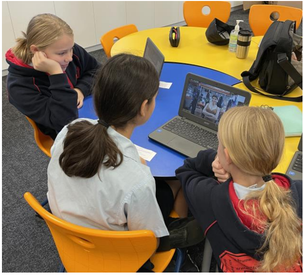
Coding: Students programmed their own dance party using <u>code.org</u>. Students used a variety of songs that would make their parents proud