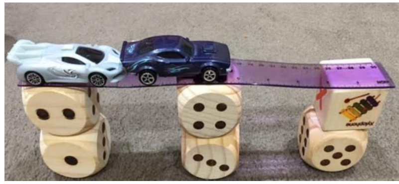
Bridges: After learning what makes bridges strong, students took up the challenge of making their own strong bridge that could hold as much weight as possible