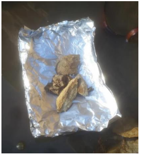
Foil Boats: After hearing the story "Who Sank the Boat?" students set out to create their own boat out of foil before testing just how much weight it could handle.