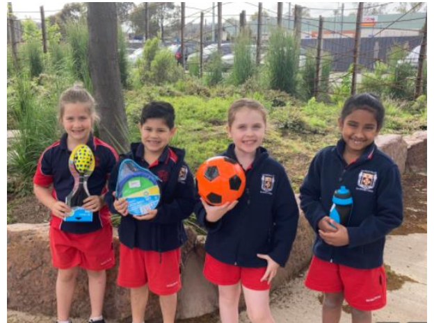
This week's token winners – Congratulations!