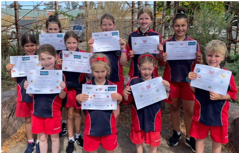
Week 7 Students of the Week & Token Winners