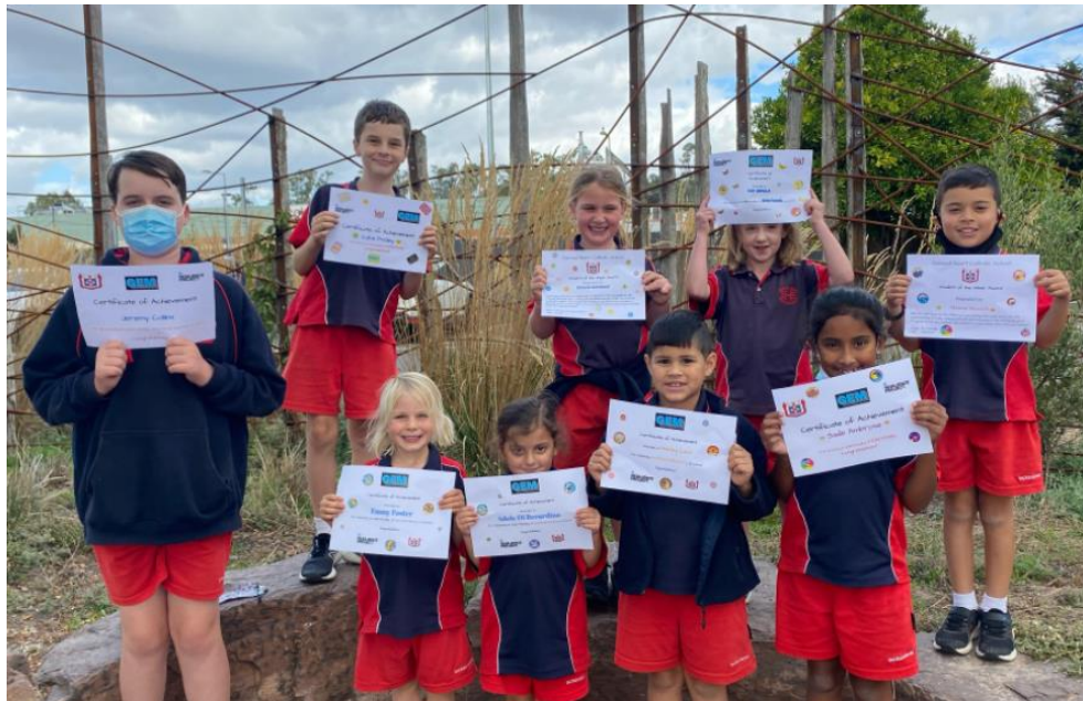
Week 9 Students of the Week & Token Winners