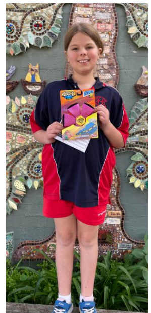
Term 2 Week 5 Students of the Week