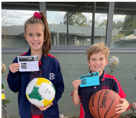
Week 8 Student of the Week