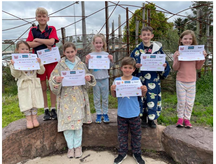
Week 7 Students of the Week