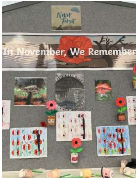
Year 1/2 – Remembrance Day Display