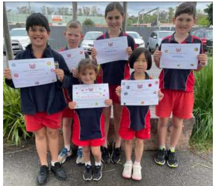
Week 6 Students of the Week